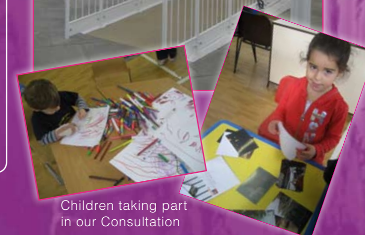
Children taking part in our Consultation